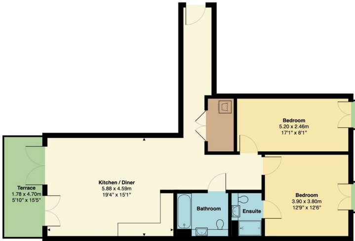
Total Area: 85.5 m² ... 920 ft² (excluding terrace) All measurements are approximate and for display purposes only

Kitchen / Diner 19'3" x 15'0" Terrace 5'10" x 15'5" Bathroom Ensuite Bedroom 12'9" x 12'5" Bedroom 17'0" x 8'0" Utility